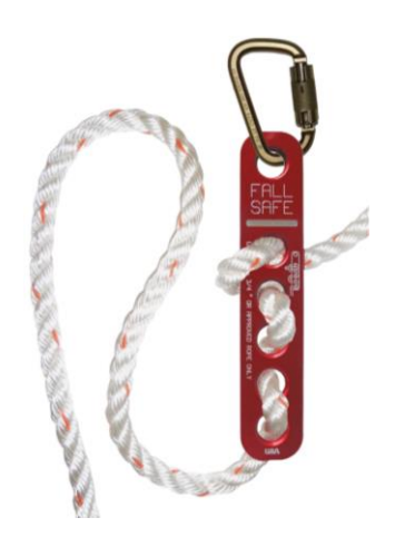
Single loop termination

Rope termination plated will resemble the pictures below when properly installed on rope lines: