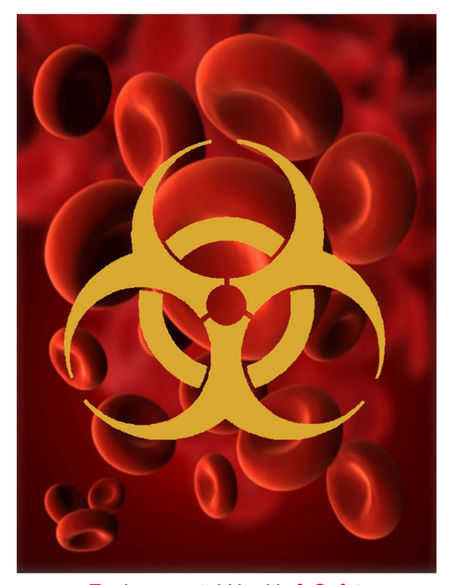
Environmental Health & Safety