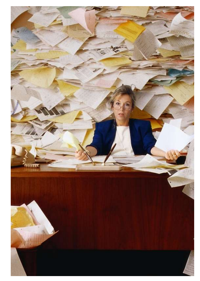
Environmental Health & Safety