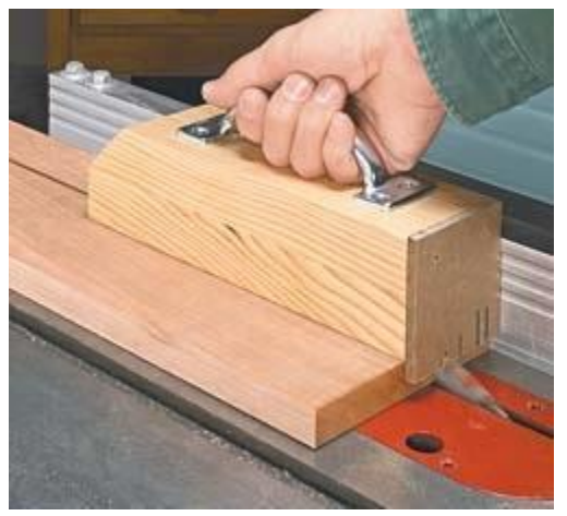
Frontal Push Block