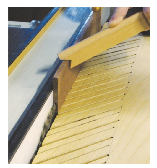
Side Push Block