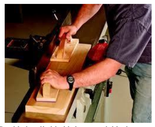
Double-handled hold-down push block

Simple push stick useful on table saw when distance between the blade and fence is narrow.