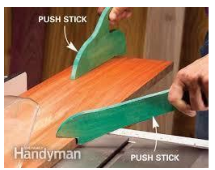
Use of two push blocks on single application