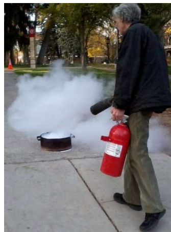
Fire Extinguisher Training