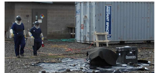
Deactivation of High Hazardous Waste

For questions regarding waste and chemical recycling, contact Kathy Kees x2788.