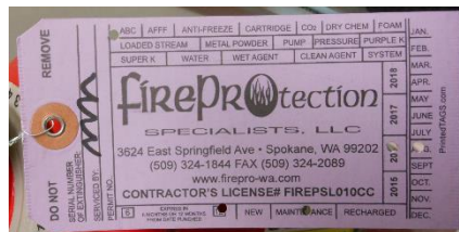
Inspection Card, front and back