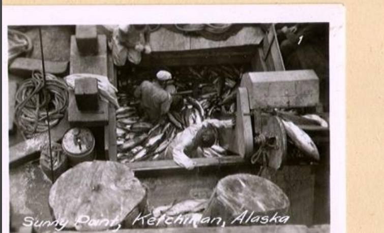
Sunny Point, Ketchikan, Alaska