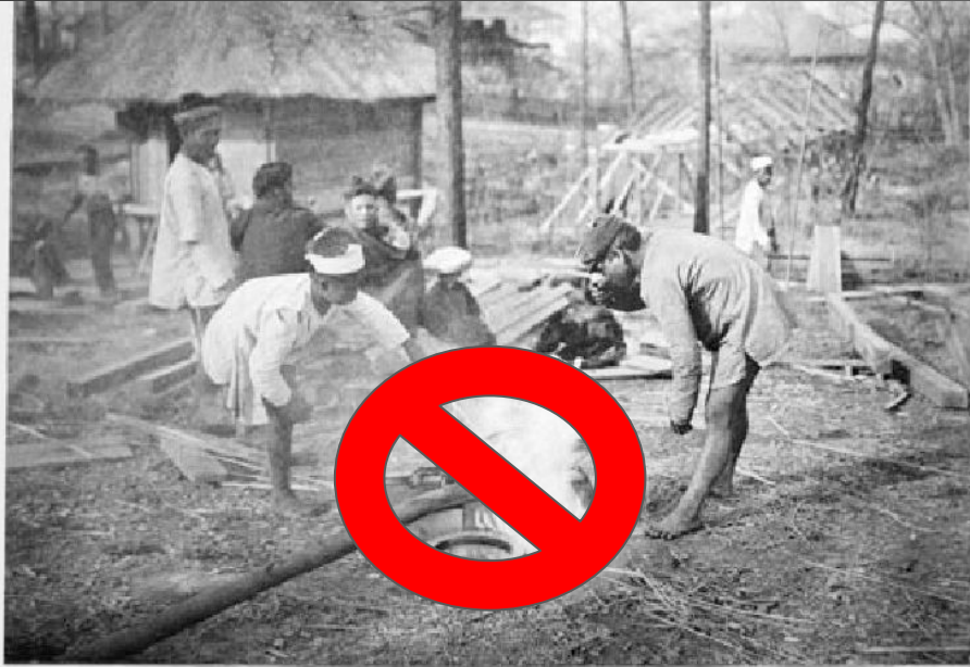
AN EXPECTANT MOMENT —Igorotes singeing a dog, preparatory to enjoying a bow-wow stew. Although they burn the hair from the carcass, their simple natures rebel at the thought of dressing the animal quite as much as at the idea of dressing themselves. The Igorotes at the fair attracted general and intense interest.